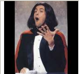
12: Opera Man