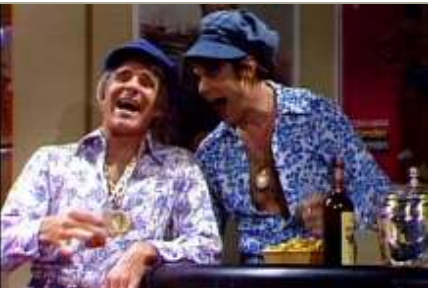
10: Two Wild and Crazy Guys