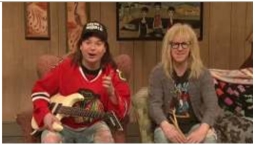
7: Wayne and Garth