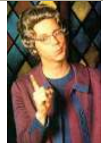
6: Church Lady