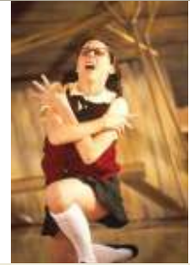
3: Mary Katherine Gallagher