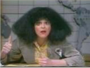
1: Roseanne Roseannadanna