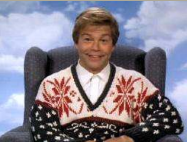
4: Stuart Smalley