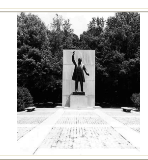
6: Theodore Roosevelt Island National Memorial