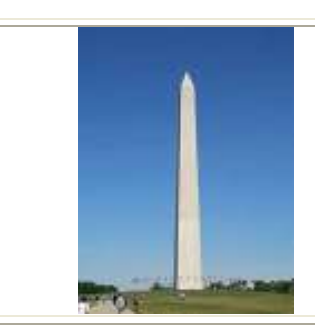
3: Washington Monument