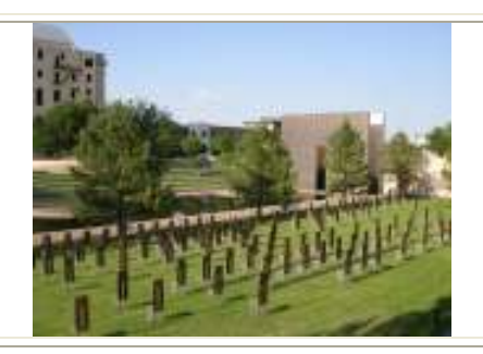
2: Oklahoma City