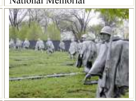
9: Korean War Veterans