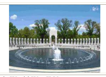
8: World War II Veterans