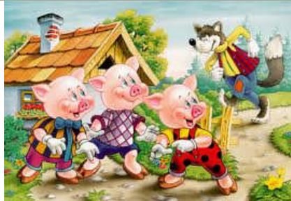
5: The Three Little Pigs