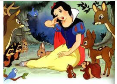
12: Snow White