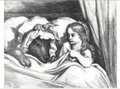
3: Little Red Riding Hood