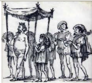
11: The Emperor's New Clothes