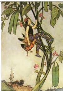
7: Jack and the Beanstalk