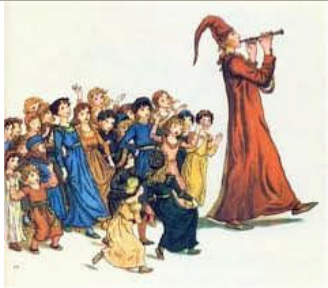
4: Piep Piper