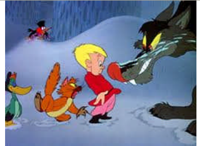
6: Peter and the Wolf