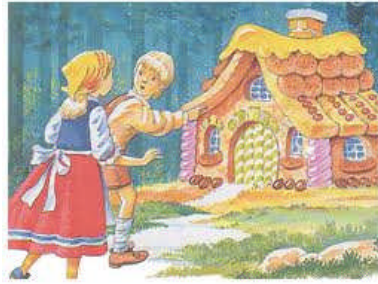
2: Hansel and Gretel