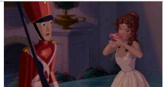
9: The Steadfast Tin Soldier