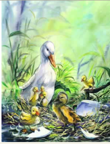
1: The Ugly Duckling