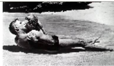
5: From Here to Eternity