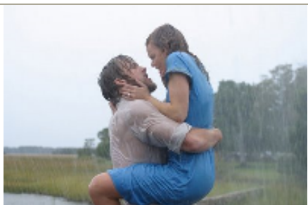
7: The Notebook