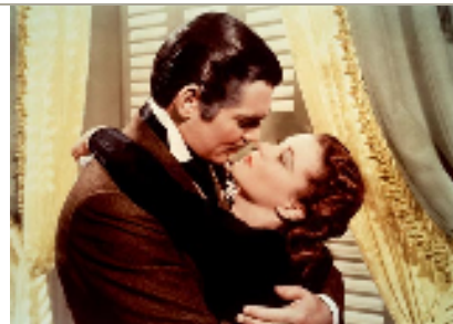
2: Gone with the Wind