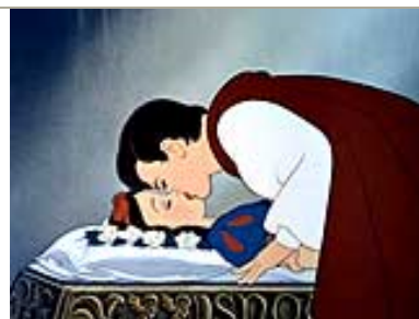
11: Snow White and the Seven Dwarfs