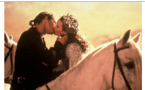
6: Princess Bride