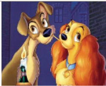
1: Lady and the Tramp