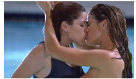
3: Wild Things