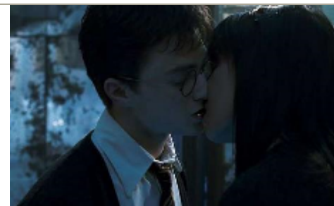
9: Harry Potter and the Order of the Phoenix